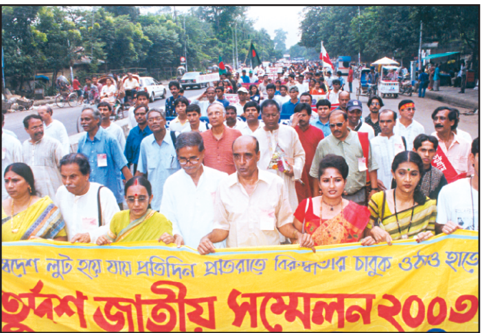
The Bangladesh Udichi Shilpi Goshthi took out a procession in the city yesterday to mark its 14th national conference.