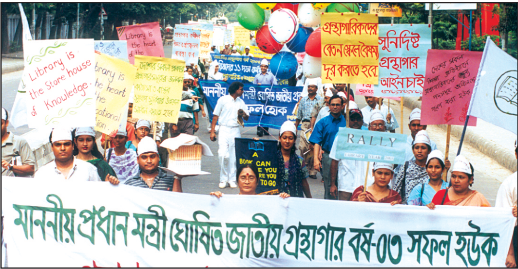
The Library Year Celebrating Coordination Council took out a colourful procession in the city yesterday to mark the Library Year-2003.