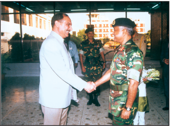
Customs officials seized foreign banknotes worth about Tk 40 lakh from a Singapore-bound passenger at Zia International Airport on Thursday night.