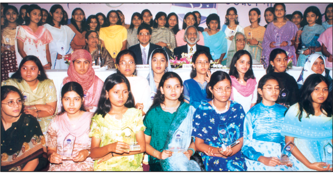
Participants of a computer training course organised by Fair & Lovely pose with Science and Information & Communication Technology Minister Dr Abdul Moyeen Khan at the concluding ceremony in the city yesterday.

In developing countries, 9.6 percent women die of cervical cancer (CC). Of the total CC deaths, 40 percent occur in South Central Asia, including Bangladesh, India and Pakistan. Presenting hospital data, experts told the meeting that in Bangladesh cervical cancer constitutes about 22-29 percent of the genital tract cancer. In 2001, over 11,950 cancerous cases were detected in the country. Of these, 30 percent were genital tract cancer, most of which constituted cervical cancer. In the Bangabandhu Skeikh Mujib Medical University (BSMMU), 161 cases of genital tract cancer were detected between March 2000 and December 2002, of which 65 or 40.4 percent were cervical cancer.