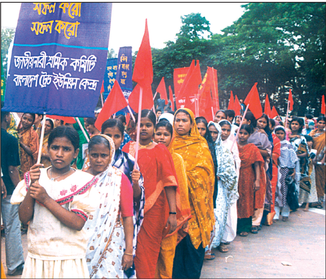
The National Women Workers' Committee took out a procession in the city yesterday on the occasion of women workers' council.