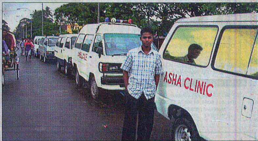
Ambulances are parked at the main gate of Dhaka Medical College Hospital (DMCH) to take patients to private hospitals with a promise of better healthcare in shady dealings with the DMCH employees.