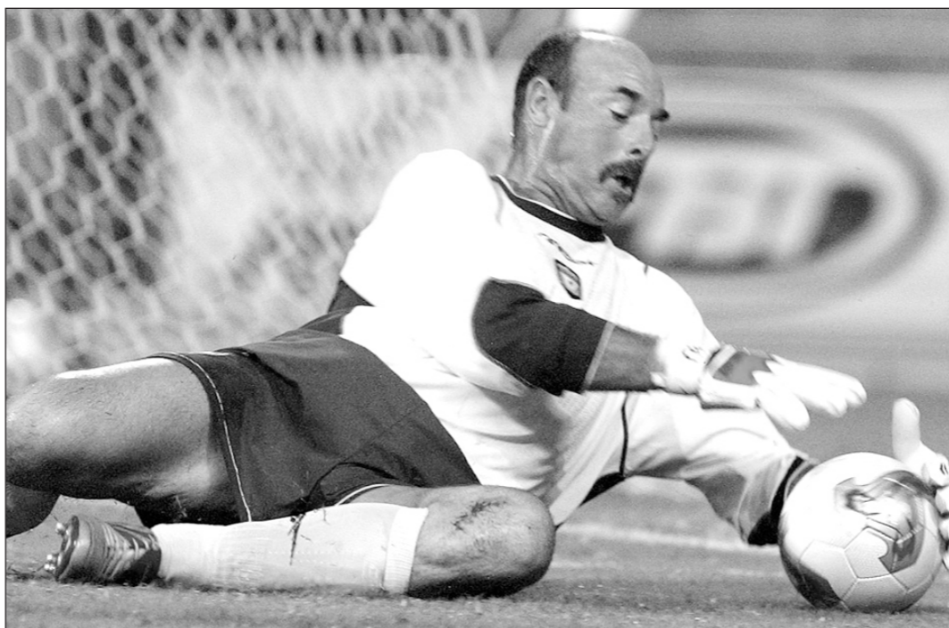
JUST LIKE OLD TIMES! Former Liverpool goalkeeper Bruce Grobbelar makes a save during a friendly match in Bangkok on October 13 against former Flamengo players. The game was organised as part of the Asian tour of golden oldies.