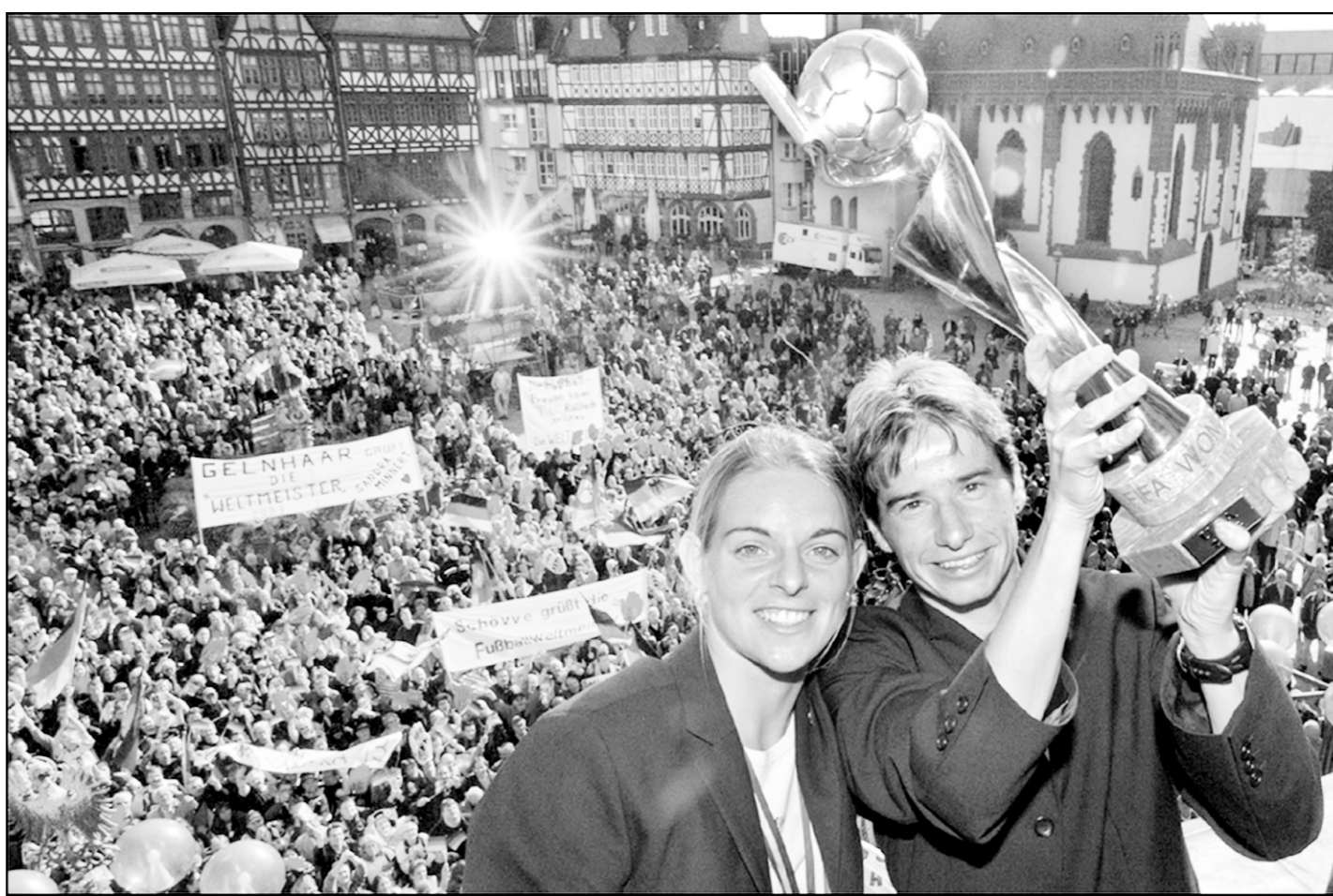
German captain Bettina Weigmann holds up the FIFA Women's World Cup trophy with golden goal heroine Nia Kuenzer at Frankfurt's City hall Roemer yesterday. Germany defeated Sweden 2-1 in Carson, California, in the final of the World Cup on October 12.

England qualified for the finals by drawing 0-0 in Istanbul where Alpay sparked trouble by confronting Beckham after the England captain missed a penalty.