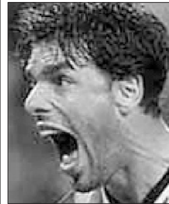
RUUD VAN NISTELROOY

was dropped from the Dutch squad for the final qualifier against Moldova last Saturday after reacting angrily to his substitution in the previous match against the Czech Republic.