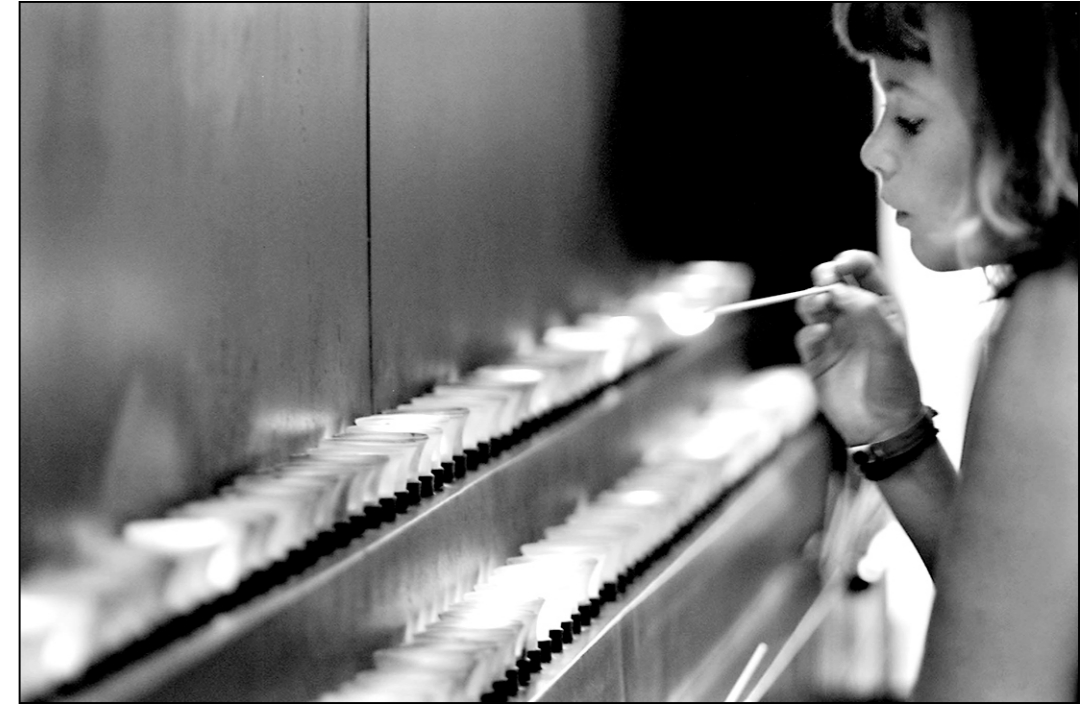
Peace lost in the peace-process!