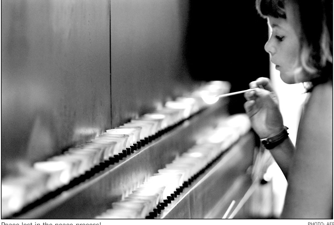
Peace lost in the peace-process!

With the dawn of the 21st century, the mankind has high hopes that this century would bring in a poverty free peaceful world where each one of us would help our fellow human beings. The insufferable degradation of poorer nations would be brought down to a tolerable level, which is an attainable objective.