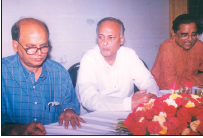
West Bengal Assembly Speaker Hashim Abdul Halim discussed the water issue with the leaders of the Workers Party at its office in the city yesterday.