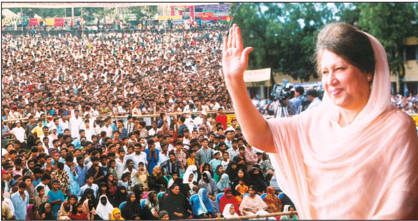
Prime Minister Khaleda Zia waves at the people during a public meeting at Noakhali Zila School ground on Saturday.