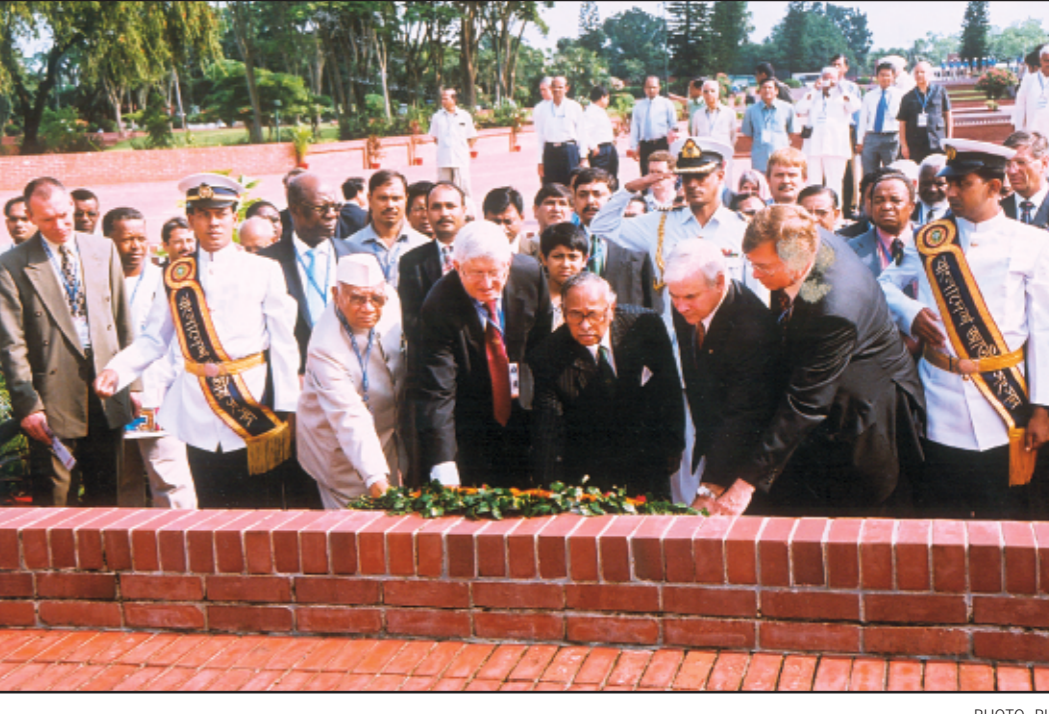
Delegates to the Commonwealth Parliamentary Association conference place wreaths at the National Memorial at Savar on Saturday to pay tribute to the Liberation War martyrs.

UNB, Dhaka President Iajuddin Ahmed and Prime Minister Khaleda Zia have conveyed their greetings and felicitations to Spanish King Don Juan Carlos and President Don Jose Maria Aznar Lopez on the occasion of the National Day of Spain. In a message to the Spanish King on Saturday, the president expressed his firm belief that the existing friendly relations between the two countries would be developed further in the years to come. Khaleda in her message to Lopez, expressed her confident that the existing bonds of friendship and cooperation, which had developed over the years, would further strengthen and consolidate in the years ahead to the mutual benefit of the two nations.