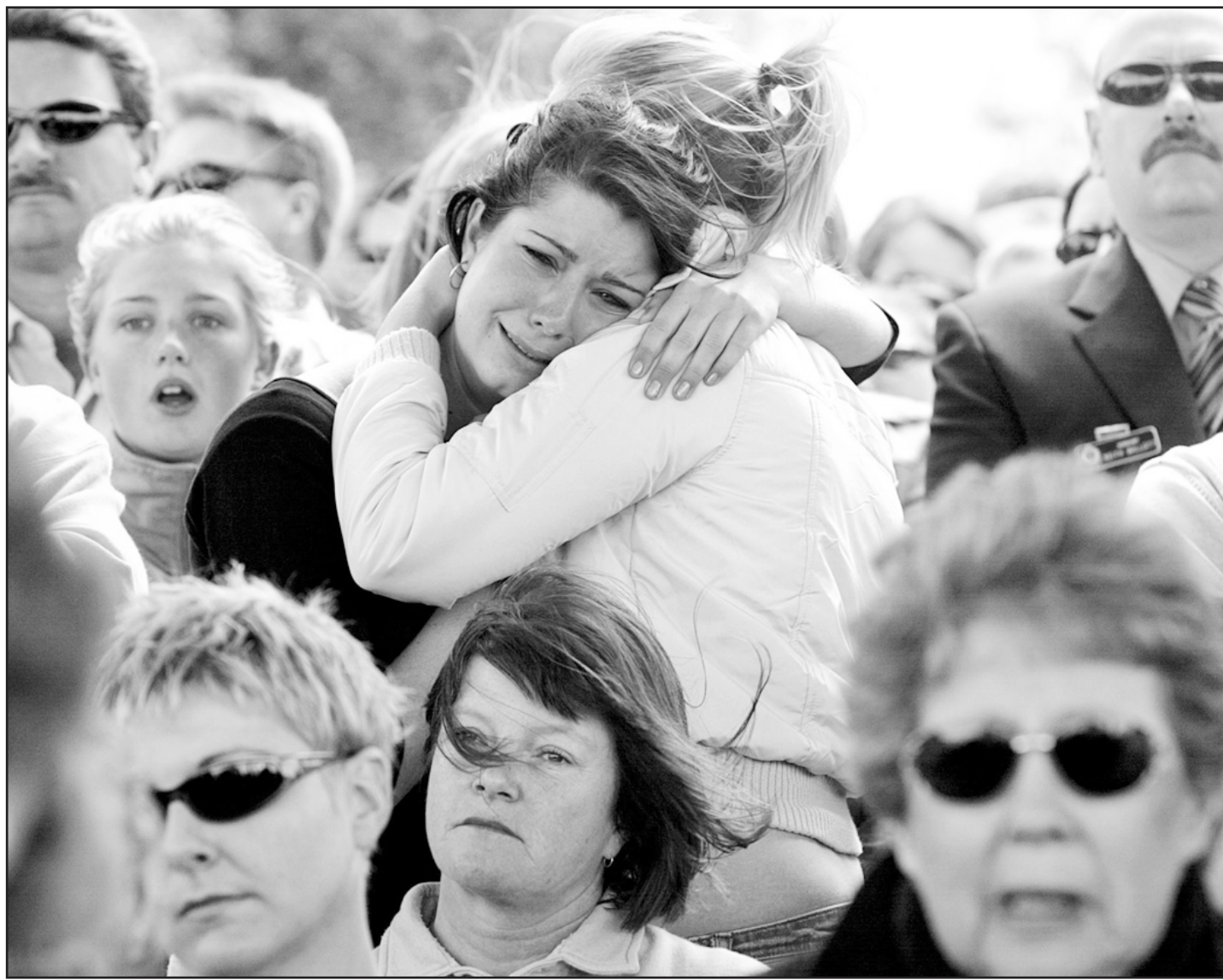
Friends and relatives of Bali bombing victims attend the dedication ceremony for the Bali Memorial at Dolphins Point on Sydney's Coogee Beach to mark the first anniversary of the Bali bombings in which 202 people died, including 88 Australians on October 12, 2002. The interlocking bronze sculpture was the work of Australian artist Sasha Reid and signifies family, friends and community bowed in sorrow and remembrance as they embrace and comfort each other.

Armed troops were posted on giant rocks overlooking the service and about 2,000 police were deployed in the Kuta area.