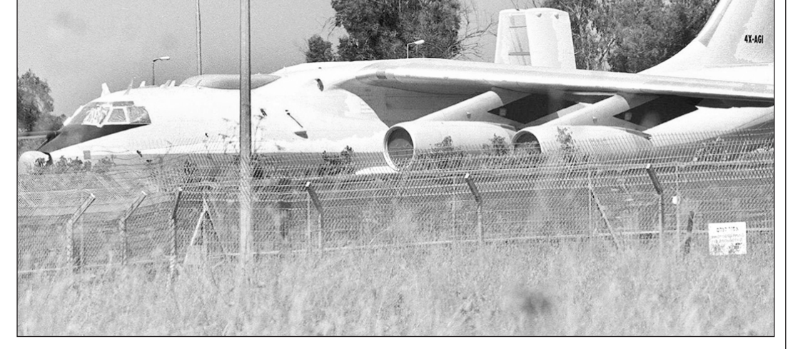
This picture taken July 5, 2000, shows a Russian jet on the tarmac at Ben Gurion Airport, Tel Aviv, in which an Israeli-made Phalcon Airborne Warning and Control System (AWACS) is installed. India and Israel, signed a deal yesterday for the sale of three Phalcon airborne early warning radar systems to the Indian air force.