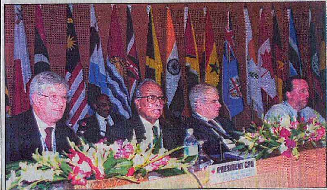
Commonwealth Parliamentary Association (CPA) conference President and Speaker Jamir Uddin Sircar, second from left, speaks at the CPA General Assembly at Bangladesh-China Friendship Conference Centre in Dhaka yesterday.

Vajpayee, who arrived here from Bali after attending the ninth summit of the Association of South East Asian Nations (Asean), said India- SEE PAGE 11 COL 2