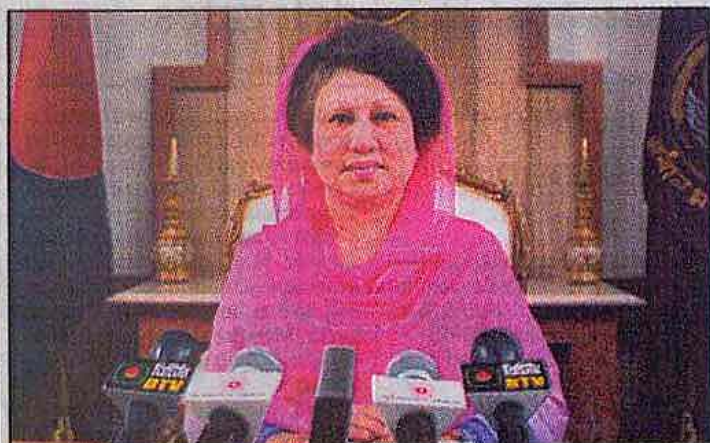
Prime Minister Khaleda Zia yesterday delivers an over-the-air speech to mark the coalition's two years in power.