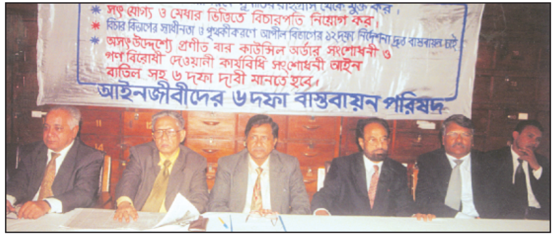
The six-point Demand Implementation Committee of the lawyers held a meeting at the Supreme Court Bar Association Hall yesterday to press for their demands.

Another milad mahfil will be held at his residence in Bhola after Asr prayers tomorrow.