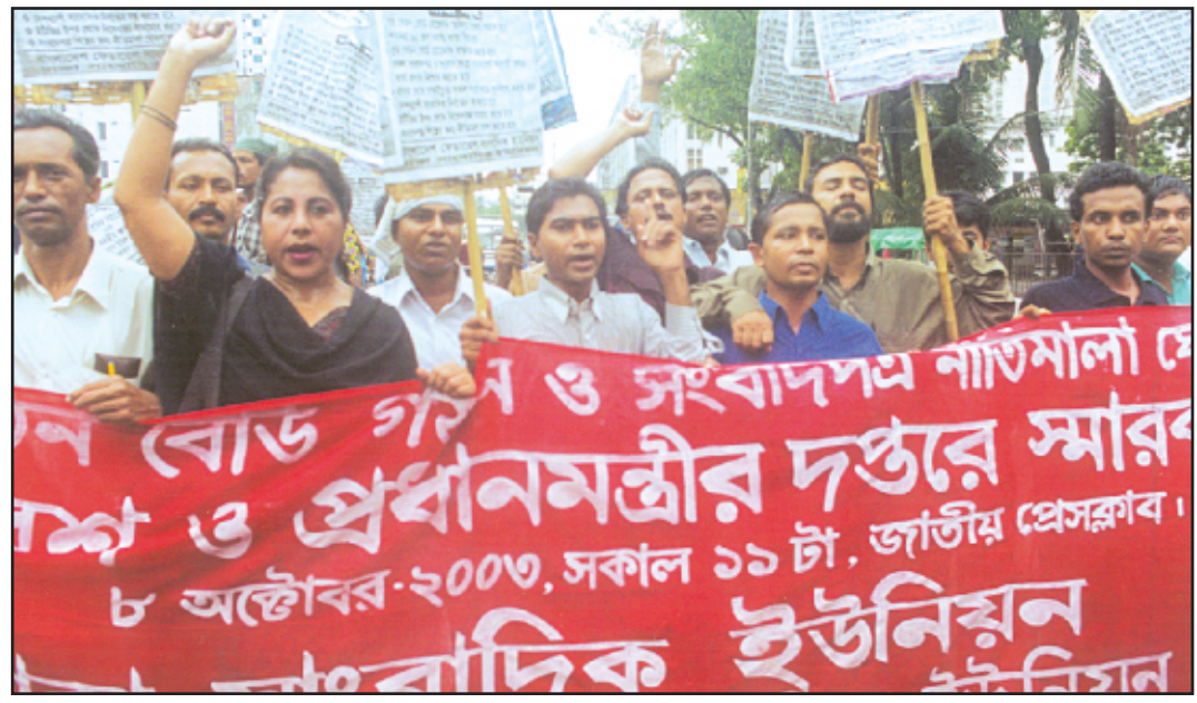
Members of the Bangladesh Federal Union of Journalists and the Dhaka Union of Journalists march towards the Prime Minister's Office yesterday to submit a memorandum.