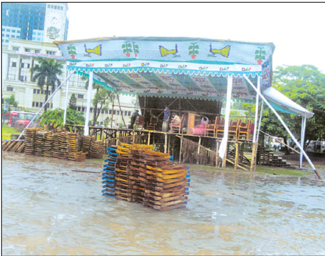
A huge marquee was erected at Paltan Maidan in the city for the public meeting of the ruling four-party alliance which was scheduled for yesterday, but the programme has been postponed due to inclement weather