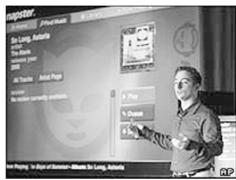
Napster has signed a contract with Microsoft

Users will now have to pay for music from the renamed Napster 2.0 site.