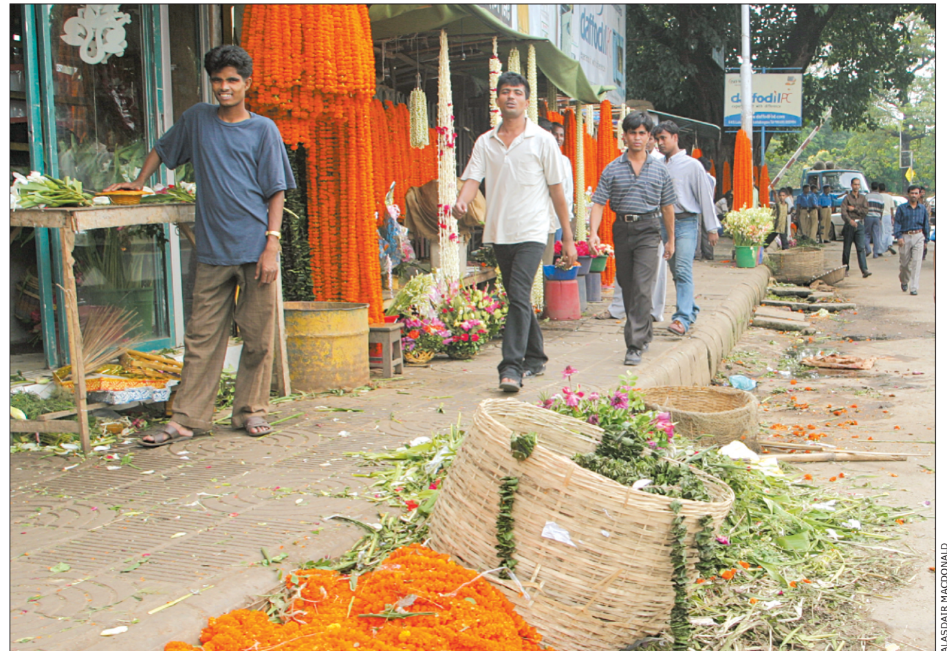
Flower shops at Shahbagh pay toll like the other shops on public land in the area.

While Dr Shajahan murder case sees no progress, Shajahan's widow and only son remain still wait for justice.