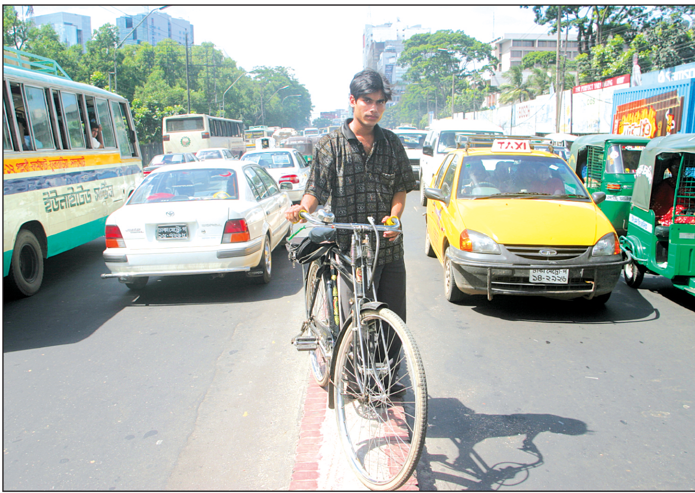
Beware! Cars with bumpers are after you.....

I am unlucky to have such a case, IO now says