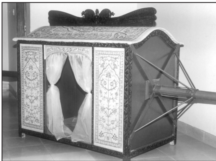
The decoration of Palki displayed at the exhibition is also a splendid piece of art.

Speakers pointed out that the exhibition, which is going on along with the WCCAP conference, has an important impact on NCCB, as it is for the first time in Bangladesh that the conference is taking place. They stressed on the necessity of simplifying the export procedures, supplying homemade quality raw materials like colour and threads that are now being imported and thus add to the production costing,