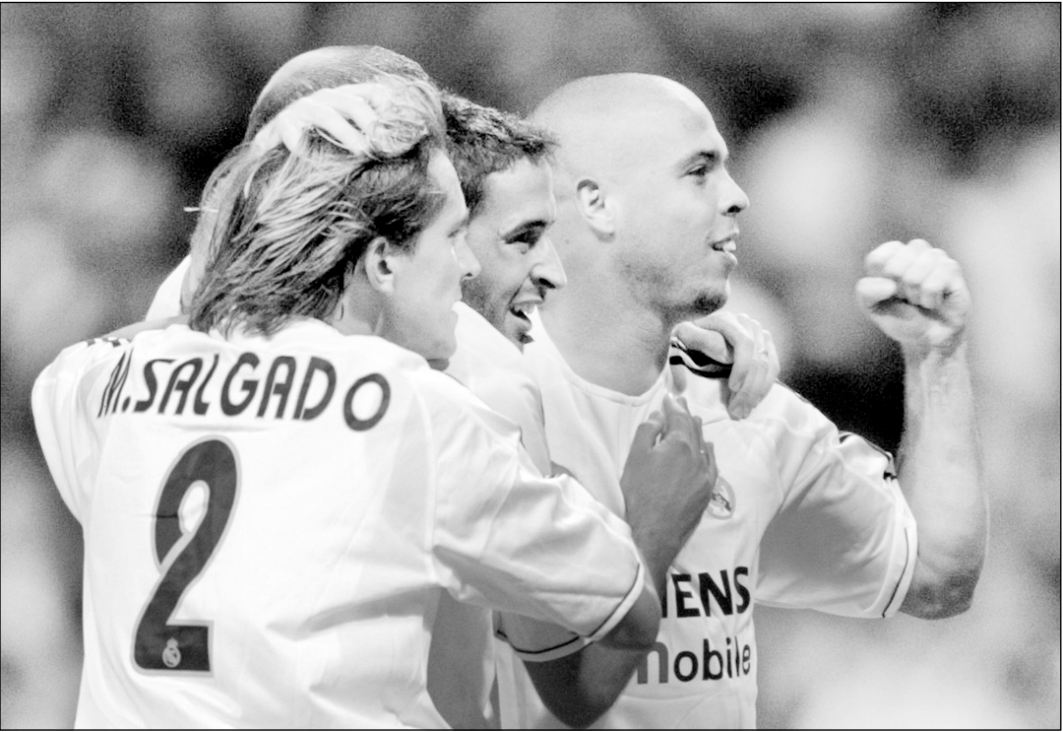
Real Madrid superstar Ronaldo (R) celebrates his first goal against Espanyol with teammates Michel Salgado (L) and Raul at the Santiago Bernabeu stadium in Madrid on October 5.