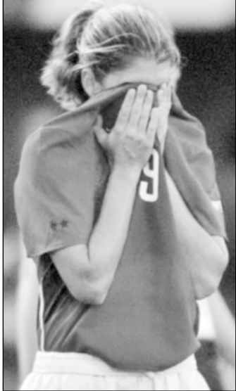
A distraught USA superstar Mia Hamm after the semifinal defeat against Germany at PGE Park in Portland, Oregon on October 5.

Sweden got two goals in the final 11 minutes of the second half from Malin Moström and