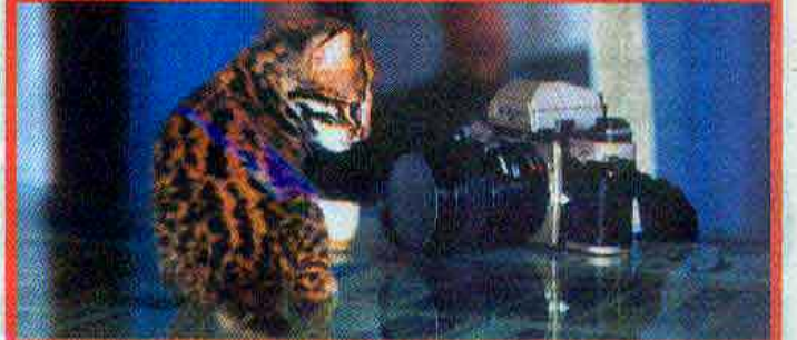
The Zoo of Sitesh Babu