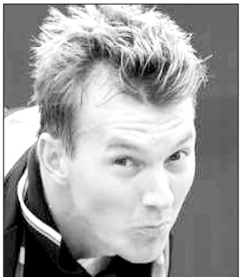
Brett Lee (Australian speedster) "It may sound a bit cliched but I just want to be a happy person. I don't want to worry if things don't go well on a particular day." The way he wants to live life.