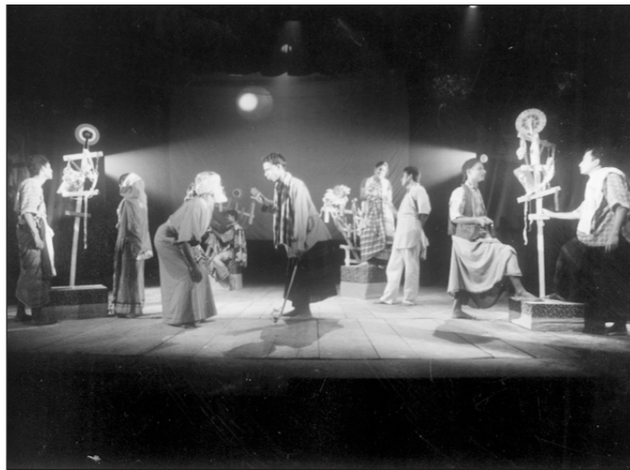
A colourful sequence from the play Prempuran by Uttaradhikar.

Uttaradhikar's past productions Sampannaiya and Sagarghat