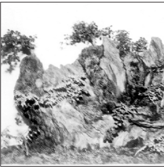
Landscape - The last green

Monwar in his speech recalled nostalgic memories of gigantic trees from his early days. The plants, once meant to beautify the city parks, are now cut down to make space for the high-rise structures.