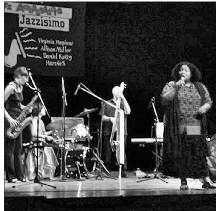
An unique presentation by the Ambassador's wife along with Jazzisimo

After every instrumental solo, the crowd appreciated with cheers rolling out from their expressions as