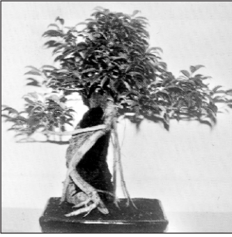
Root over rock