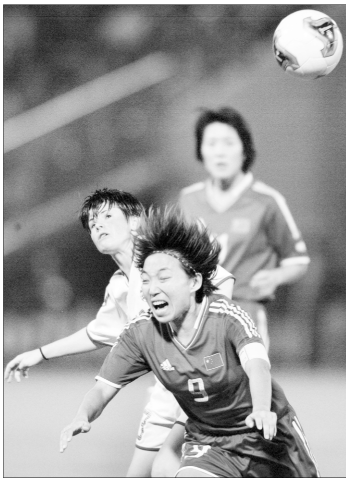
THE LAST FALL! China's superstar Sun Wen (front, No. 9) loses balance after being challenged by a Canadian at PGE Park in Portland, Oregon on October 2.