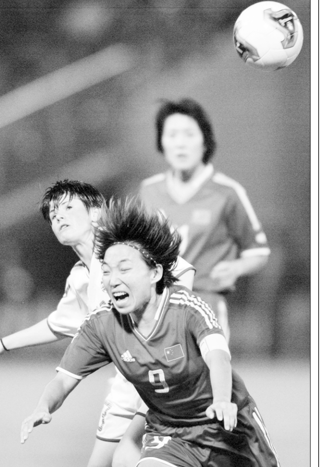
THE LAST FALL! China's superstar Sun Wen (front, No. 9) loses balance after being challenged by a Canadian at PGE Park in Portland, Oregon on October 2.

Charlton, Tottenham v Everton, Wolverhampton v Manchester Sunday: Aston Villa v Bolton (1505 GMT), Middlesbrough v Chelsea (1300 GMT)