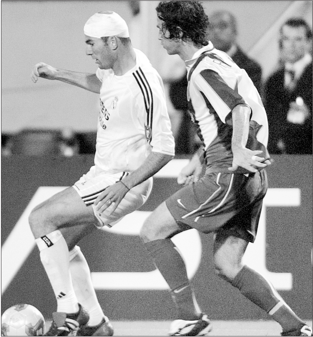
Zinedine Zidane (L), with his head bandaged following a nasty cut, turning it on against FC Porto at Oporto on October 1.

As Porto fans streamed out of the stadium exits, Raul replaced Ronaldo but his first attempt at goal was an uncharacteristically misjudged lob which was far too high.