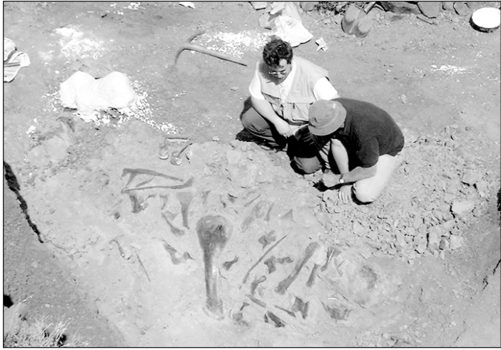
This recent handout picture given by the French Museum of Natural History (MNHN) shows scientists looking at bones of "Tazoudasaurus Naimi", a nine-metre long herbivorous sauropt from the middle Jurassic age, discovered recently in Tazpuda, southeastern Morocco. The officially named "Tazoudasaurus Naimi", was discovered by a team of scientists from Morocco, France, Switzerland and the United States.