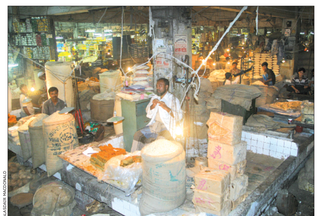
Lack of ventilation causes health hazaards to thousands of people.

Traders, businessmen and labourers face serious health hazards every day