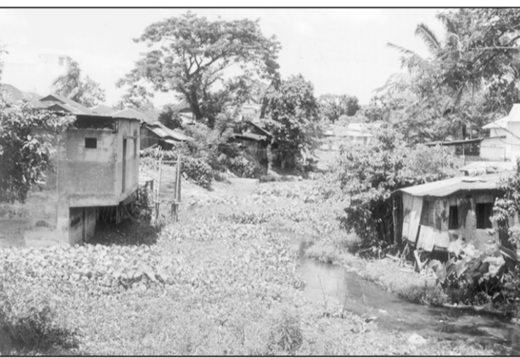
PHOTO: STAR Potential turns into problem: (Left) The Narasundha river flowing through Kishoreganj town has become a breeding ground for mosquitoes as it has been totally covered with water hyacinth. (Right) At Bara Bazar in the town the river has become a canal due to encroachment by unscrupulous people. The river needs to be saved by demolishing unauthorised structures and re-excavating to keep the environment of the town free from pollution.