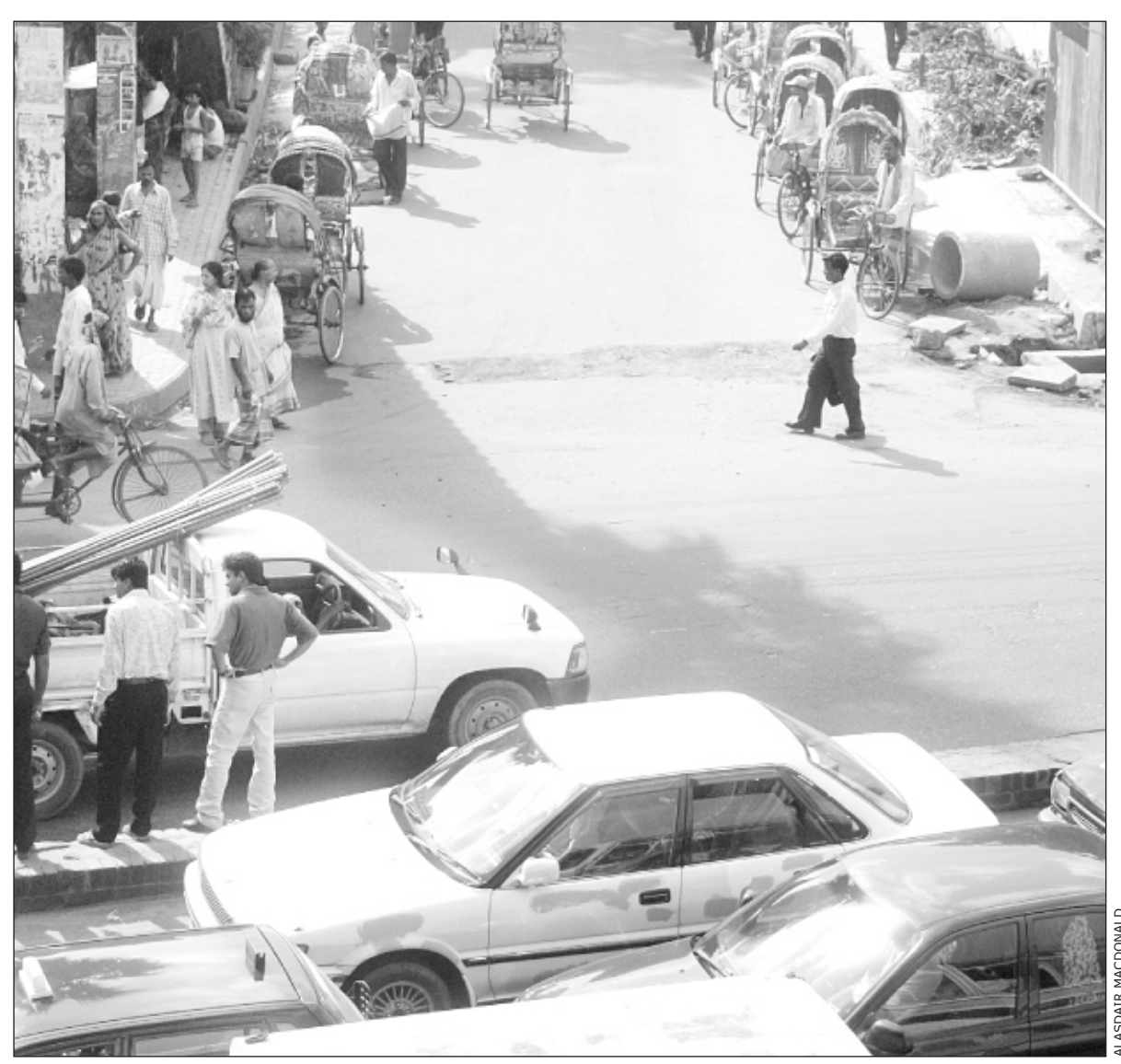
The more rickshaws are made off limits, the more lanes and by-lanes become congested.

Lanes and by-lanes in the city, already jammed with thousands of rickshaws, will plunge into more traffic tangles, as a move is on to phase out rickshaws from six major roads from November in the