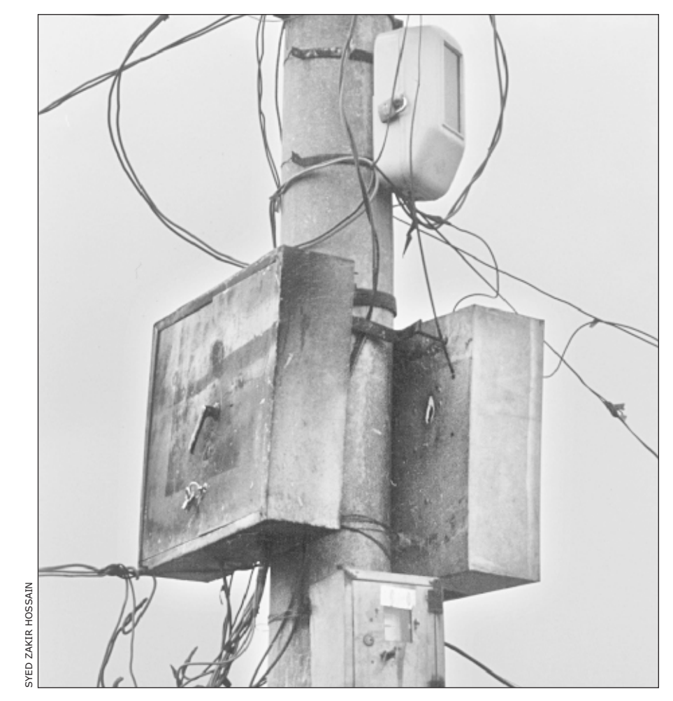
Authorities are installing meters on poles to charge slum dwellers for the electricity.

"They cannot seize our vehicles. Rickshaws are the only means of our income," another rickshaw-puller said.