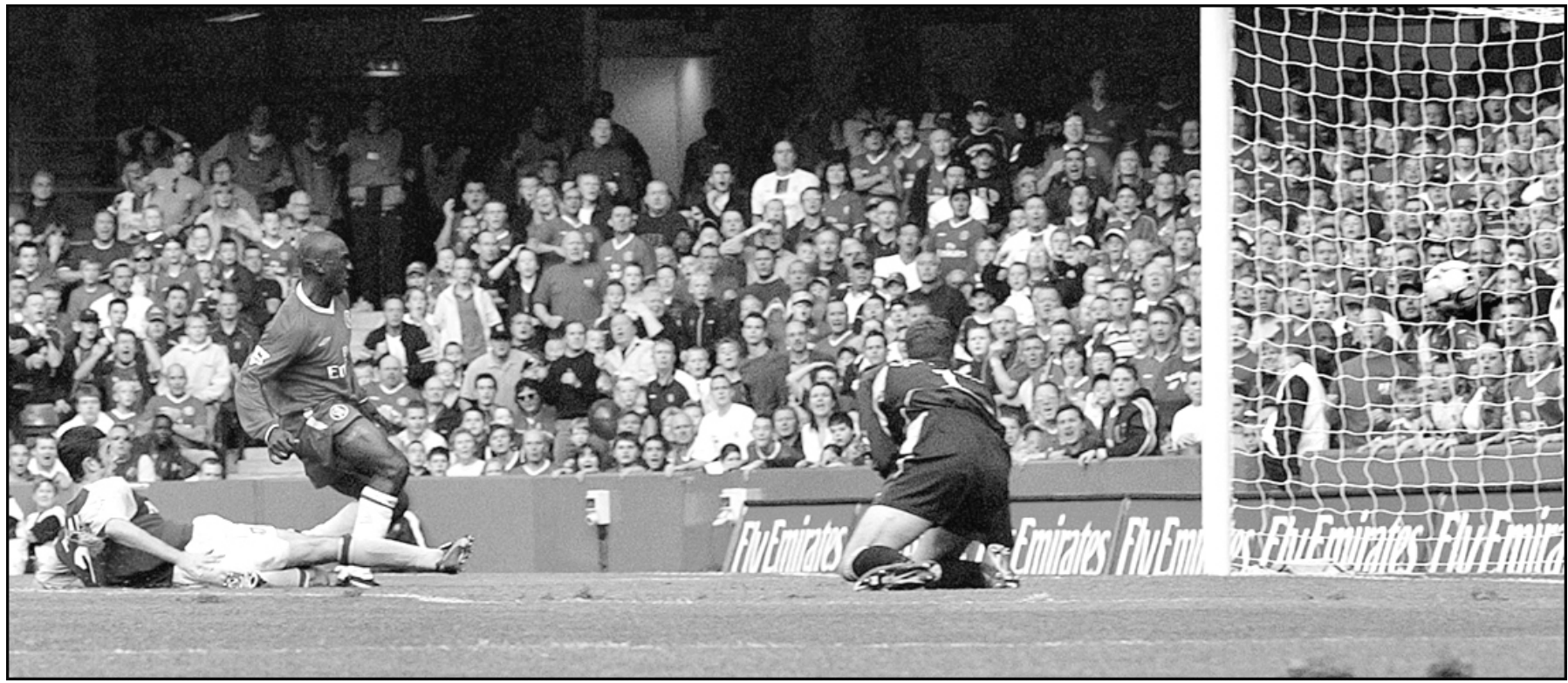
Chelsea's Dutch striker Jimmy Floyd Hasselbaink (C) scoring against Aston Villa at Stamford on September 27.