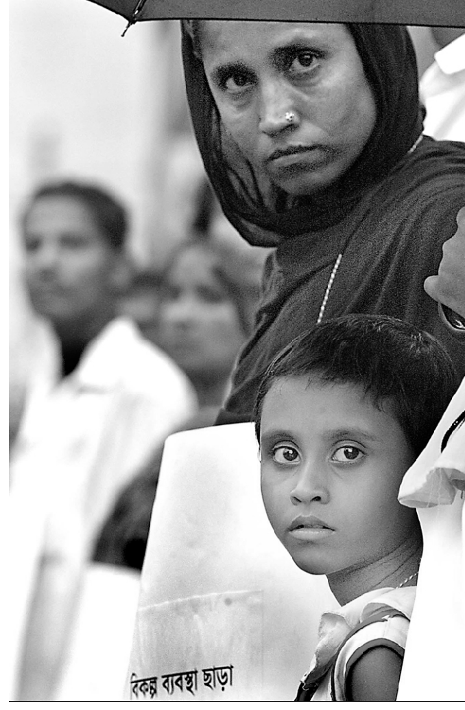
Victims of a just decision?