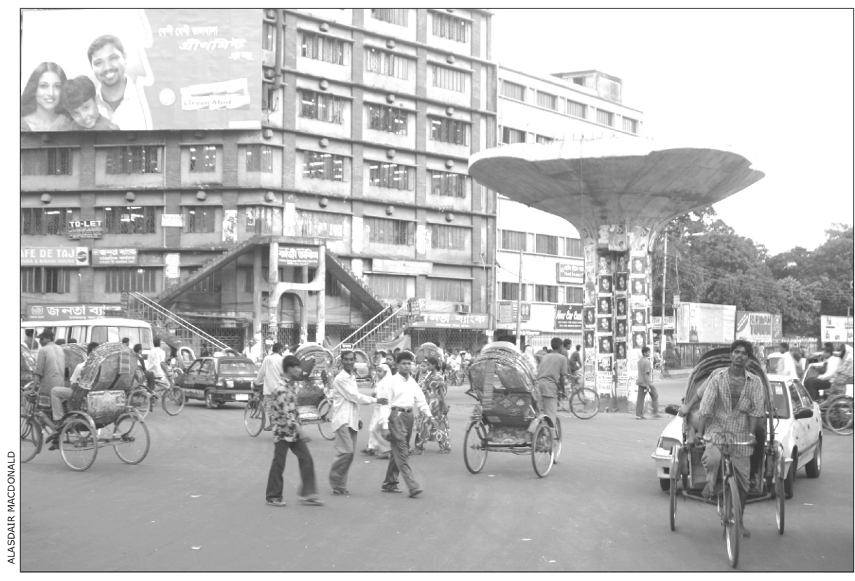
A Half-finished foot over-bridge at Mughbazar intersection becomes a monument to DCC failures.

The DUTP is building nine overhead footbridges at nine important crossings of the city at a cost of Tk 9 crore. The World Bank will bear seventy-five per cent of the total cost. The GOB will bear