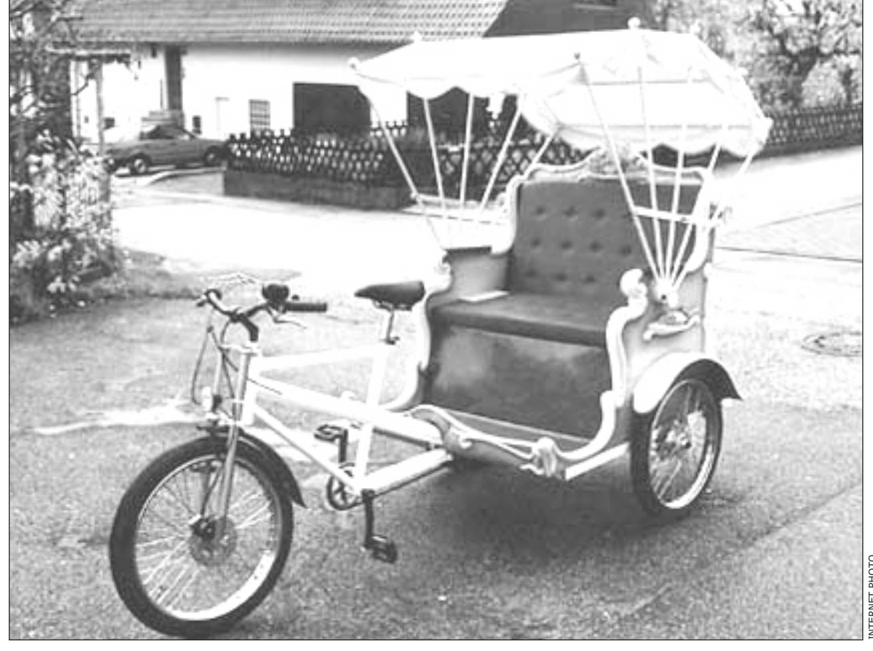
A redesigned rickshaw fit for use in developed countries could cost as much as three lakh taka in Germany.

Bangladesh has the potential to introduce modern designs to compete in the international market