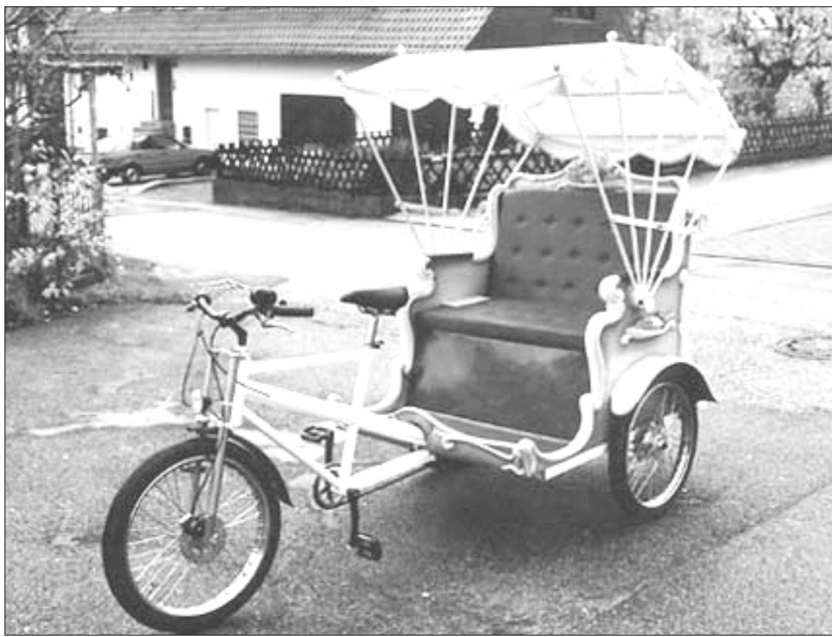
A redesigned rickshaw fit for use in developed countries could cost as much as three lakh taka in Germany.

Bangladesh has the potential to introduce modern designs to compete in the international market