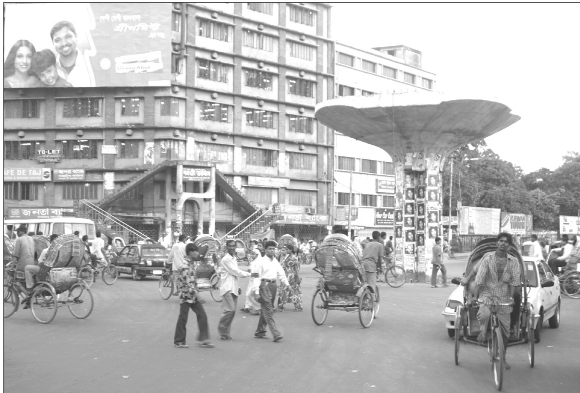
A Half-finished foot over-bridge at Mughbazar intersection becomes a monument to DCC failures.

The DUTP is building nine overhead footbridges at nine important crossings of the city at a cost of Tk 9 crore. The World Bank will bear seventy-five per cent of the total cost. The GOB will bear the rest.