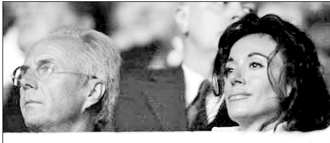
England manager Sven Goran Eriksson and his girlfriend Nancy Dell'Olio watch from the stands the English Premier League match between Arsenal and Newcastle at Highbury on Friday.