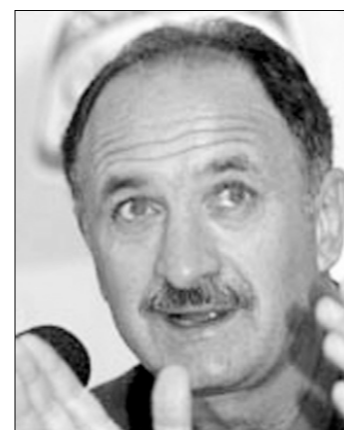
LUIZ FELIPE SCOLARI

Only 41.7 per cent of respondents said they thought the 54-year-old Brazilian has done a good job since he became Portugal's national coach in January, while 44 per cent felt his performance was either bad or "so-so".