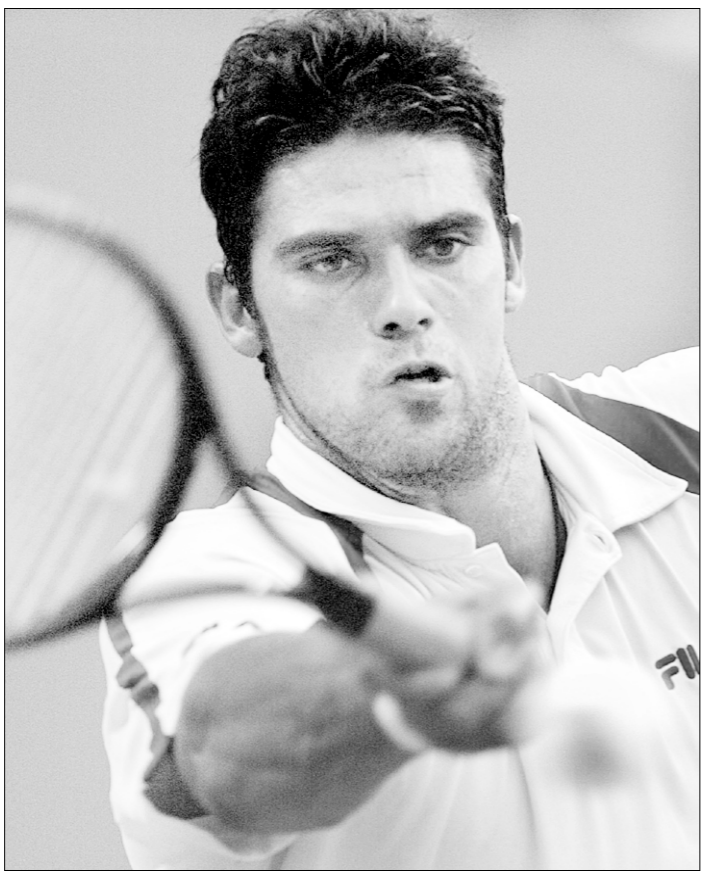
Mark Philippoussis in action against Robin Soderling of Sweden during their Heineken Open semifinal clash in Shanghai yesterday.

Zimbabwe fast bowler Andy Blignaut has got his hunger back and is now looking to feast on Australia's batting order.