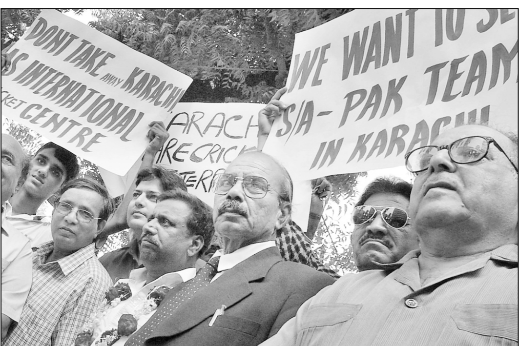
Pakistani cricket fans demonstrate in Karachi to protest the exclusion of this southern port city from the itinerary for South Africa's tour yesterday.