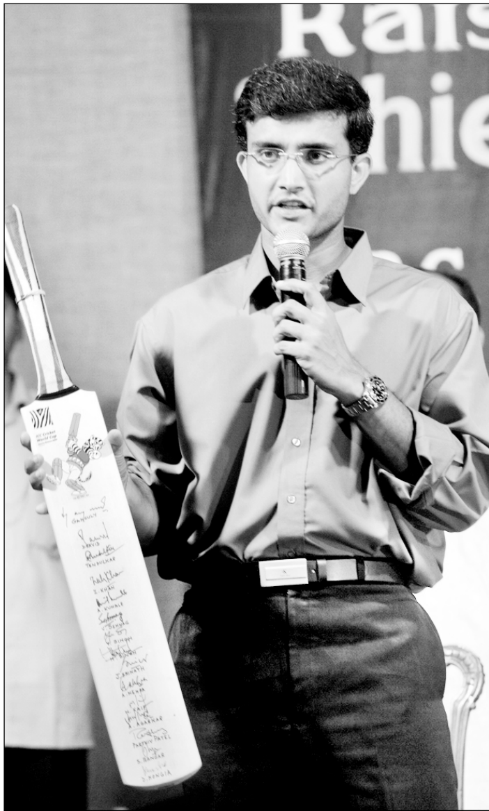
Captain Saurav Ganguly holds a World Cup bat signed by the Indian team members during an auction in Kolkata yesterday. The event was organised to raise funds for a government-run children's hospital in the city.

The new tour, from October 1-28, is expected to consist of two Tests and five one-dayers.