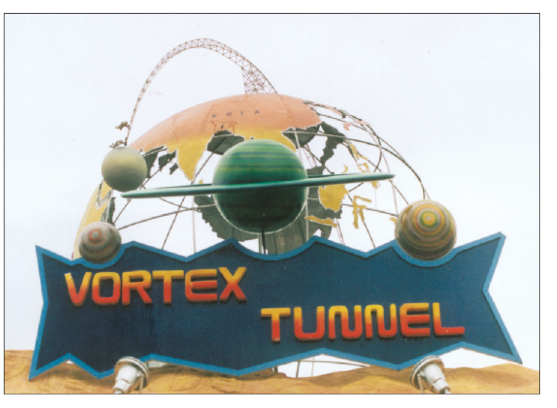
The Fantasy Kingdom will launch Vortex Tunnel today.

A rally, organised by Islamic Constitution Movement (ICM), will be