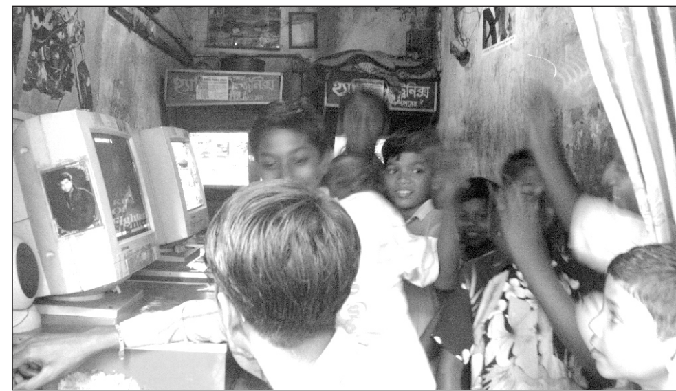
Video game outlets are becoming one of the few entertainment options left to city children.