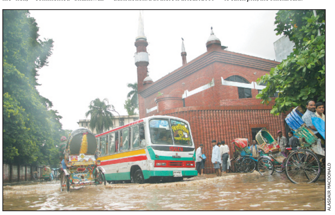
An hour-long water logging is enough to create huge traffic jams in the city.

Moreover, carpeting of roads by DUTP throughout the city is preventing proper drainage. DUTP has covered many of the man-holes during the road carpeting program which has caused rain water to move to catch pits, the official said