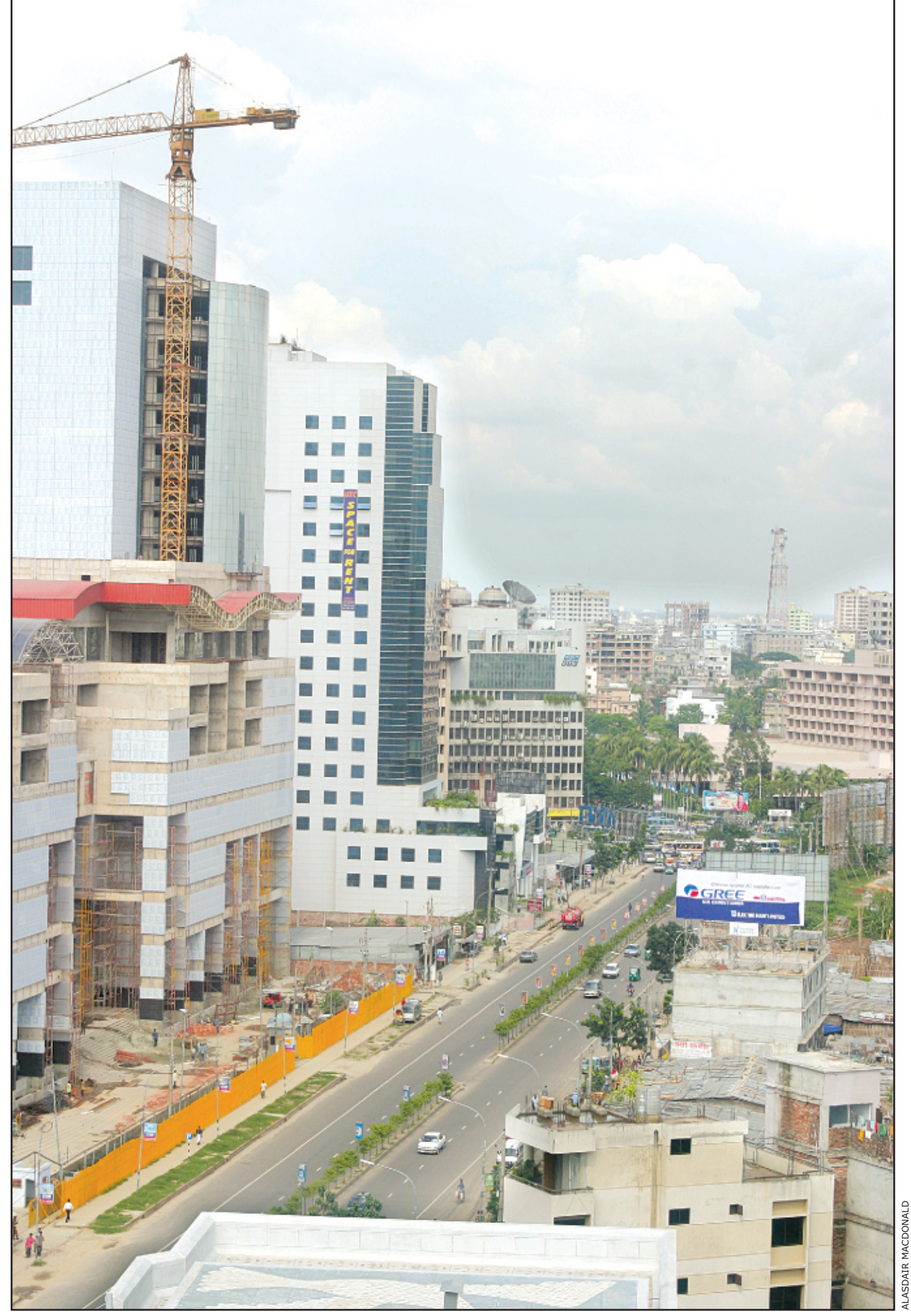
City landscape is rapidly changing due to construction of high-rise buildings, which the government now trying to regulate.

The Armenian Church in Armanitola at Old Dhaka was built in 1791 by the Armenian colony on Holy Church Road. Scores of Armanian families settled in the country over a long period. Most of these settlers had arrived here as traders. Many have ever since integrated into Bangalee culture while the last of the original Armenians is now living in Dhaka.