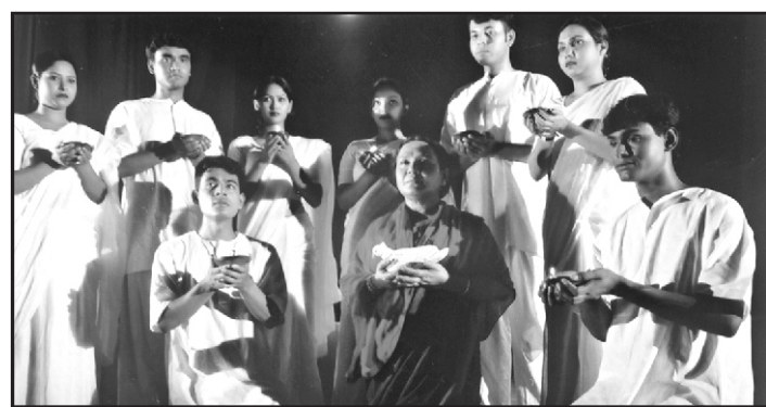
Amar Shantan Amar Anchol by Nagorik Natyangan Ensemble

The schedule of the plays to be staged during the festival is as follows: