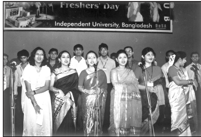
Fresher's of IUB putting up their best on stage

The show started off with a wonderfully coordinated chorus of Dhono Dhanno Pushpe Bhora by all the performers and organisers after the anchor gave a brief history of IUB and the activities involved with the institution. Performances worth mentioning