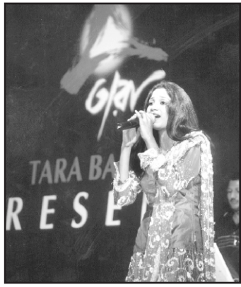
Devdas famed play back singer Shreya Ghoshal performs

cordial assistance through their journey of two years. They presented the