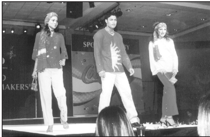
Models on the ramp

NIFD also expressed its gratitude to the people of different sectors for giving