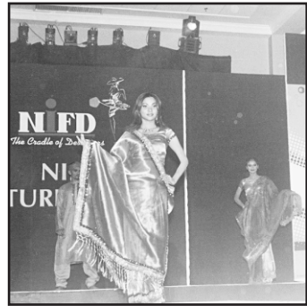
Models displaying creative outfits.

FASHION designing is treated as one of the most creative fields in this modern era. The world is catching up the infectious trend of fashion, which has in fact created opportunities for millions. To create professionals providing world class training to cater the need of this lucra-