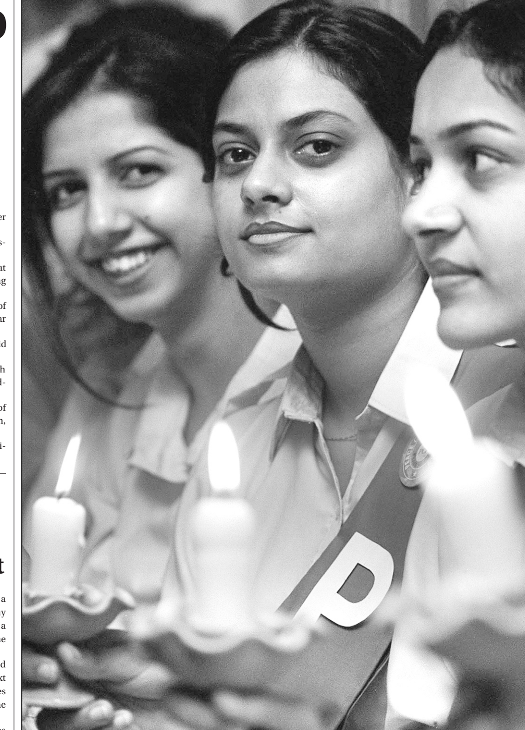
Unidentified Pakistani schoolgirls smile as they hold candles during a peace ceremony organised by the United Nations in Islamabad on Sunday. Pakistan joined the world in commemorating International Peace Day reaffirming its commitment to the UN Charter and its principles of peace, development and non-violence.

Asked if he was willing to grant a larger role to the United Nations in Iraq's political development, Bush replied: "I'm not so sure we have to.'