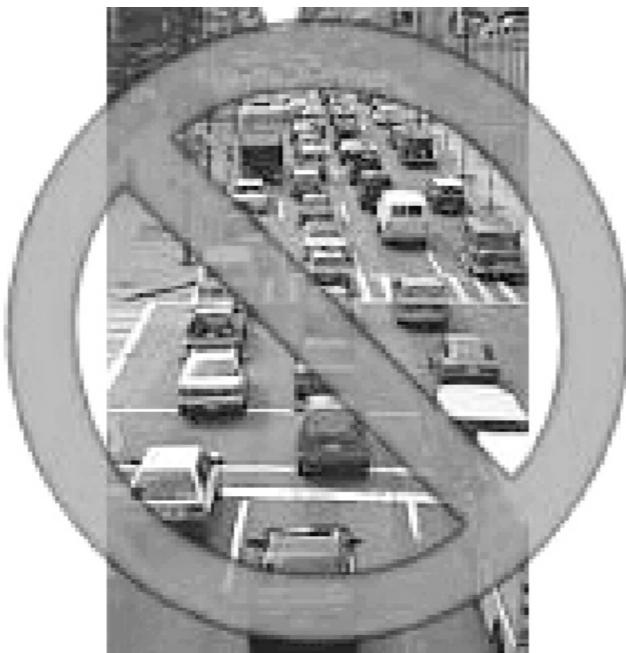
No to car

BOT is a popular scheme/system that exists all over the world, where the government gets the infrastructure running without paying initially, but can enjoy the benefits after the investor gets back the profit and hand over the