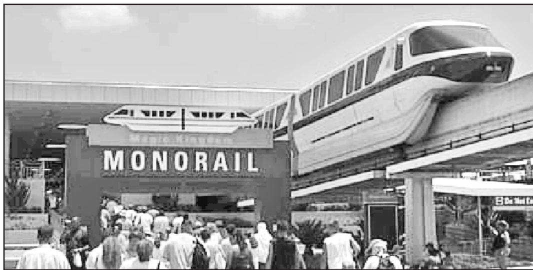
Yes to mass transit mono-rail