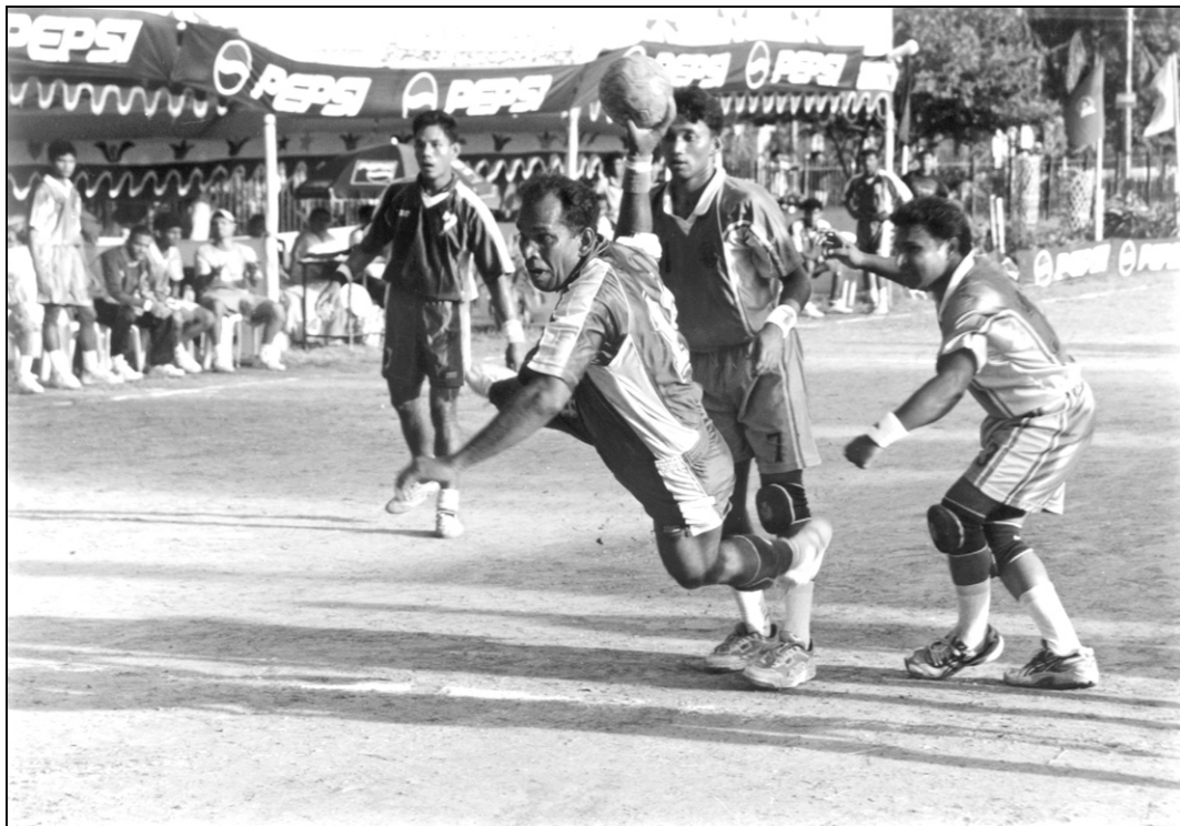
Action from the Pepsi 16th men's handball championship match between Dhaka and Bangladesh Police yesterday.