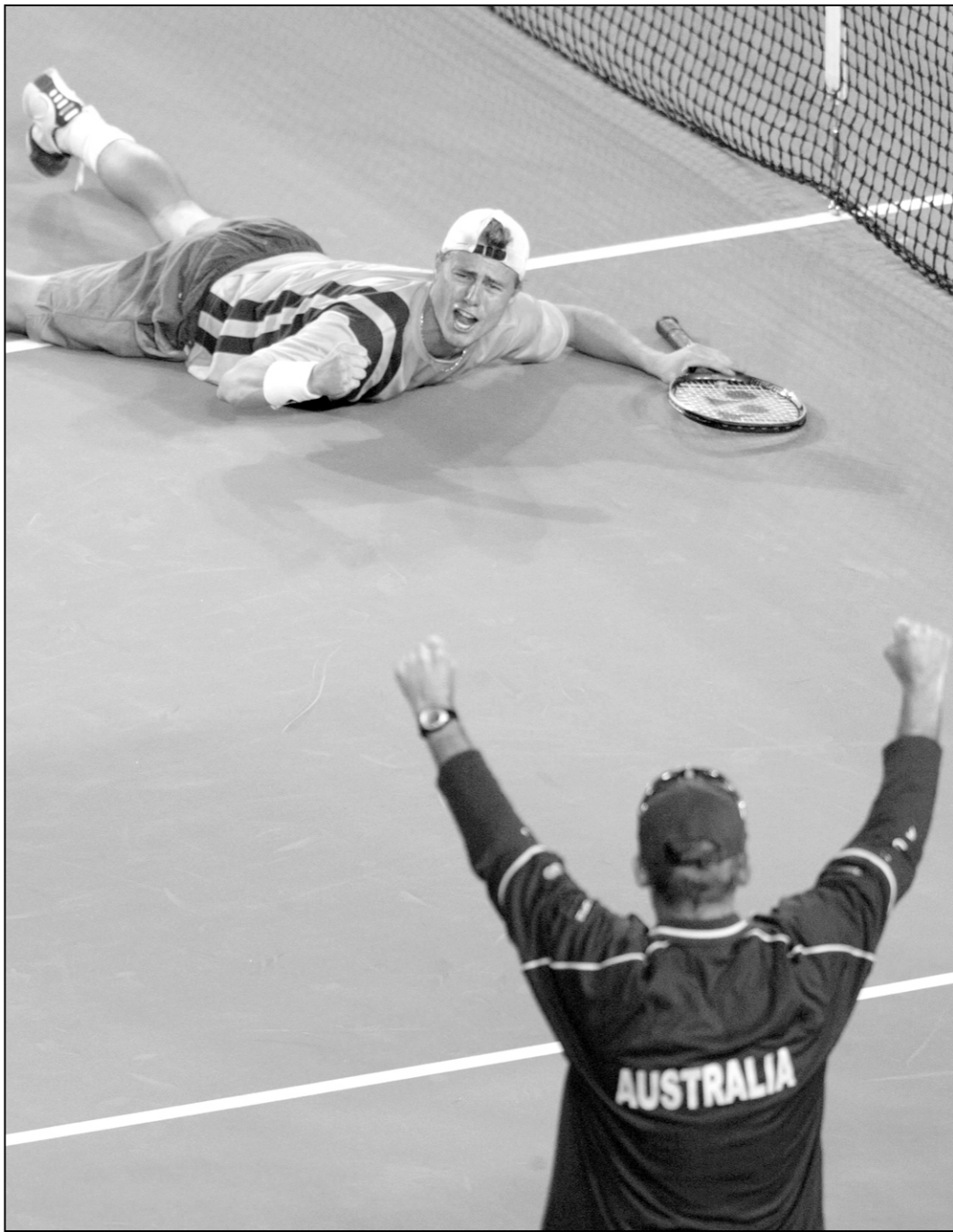
SLIDES IN DELIGHT: Lleyton Hewitt dives after guiding Australia into the Davis Cup final.

Even journalists had to go through metal detectors and their bags were screened which was not the case in the first Test last month.