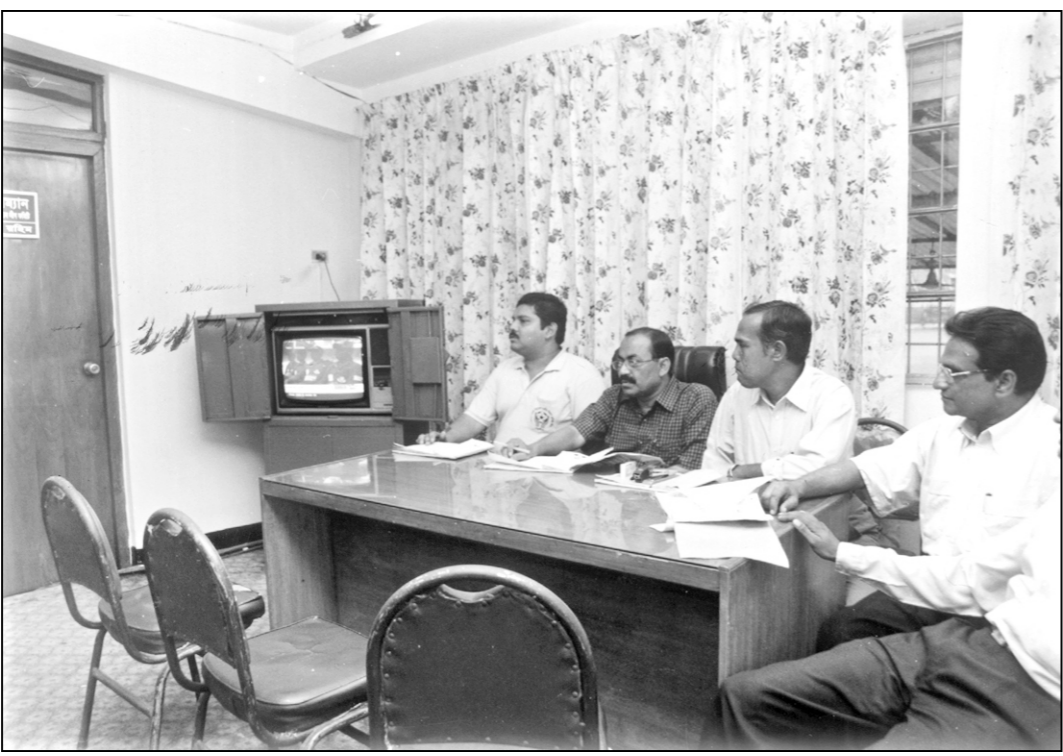
LET'S WATCH TELEVISION INSTEAD: Officials of the Dhaka Metropolis Football Association watch proceedings in Karachi seeing that no footballers turned up for the inter-club transfer yesterday.