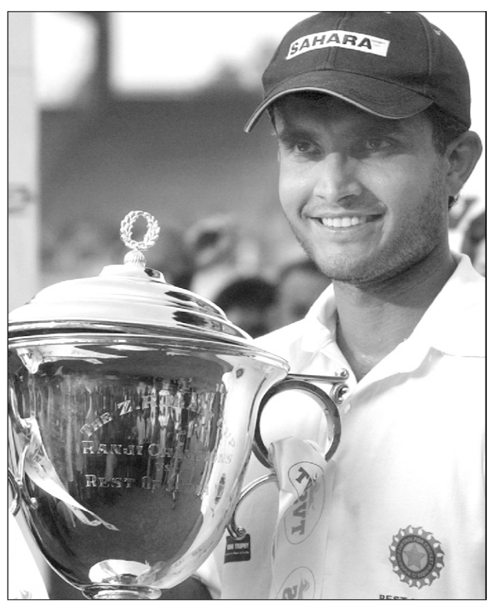
The Rest of India captain Saurav Ganguly poses with the Irani Cup after defeating Mumbai at Madras yesterday.