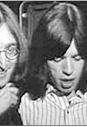
John Lennon and Mick Jagger were filmed in 1969.