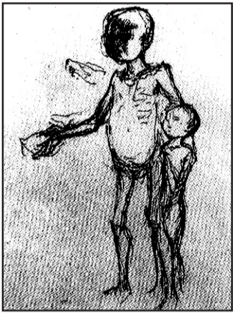
Sketch by Zainul Abedin

INTERNATIONAL FILM FESTIVAL BANGLADESH 18-25 SEPTEMBER 2003