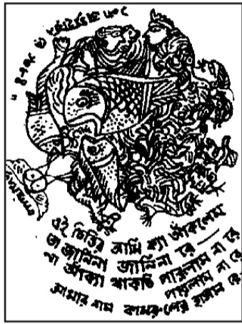
Sketch by Quamrul Hassan