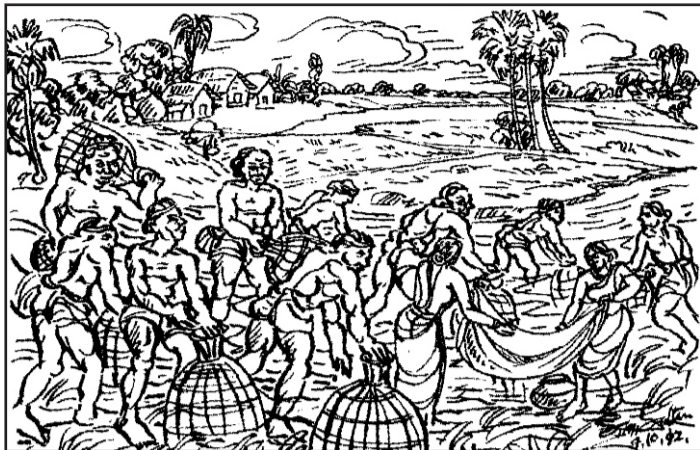
Fishing, S M Sultan

Rafiqun Nabi's woodcut, "Windy noon" presented strokes of black which stood for the trunks and branches of the trees, with shades of green which brought in the foliage. In between were subtle streaks of pink. Below was the water where the paper had been left blank and on that space were outlines of resting boats. The variations of the green went well with the black, creating a scene of peace and