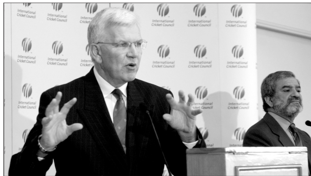
International Cricket Council (ICC) chief executive Malcolm Speed (L) addresses a press conference at the Cricket Club of India in Bombay yesterday while ICC president Ehsan Mani looks on.