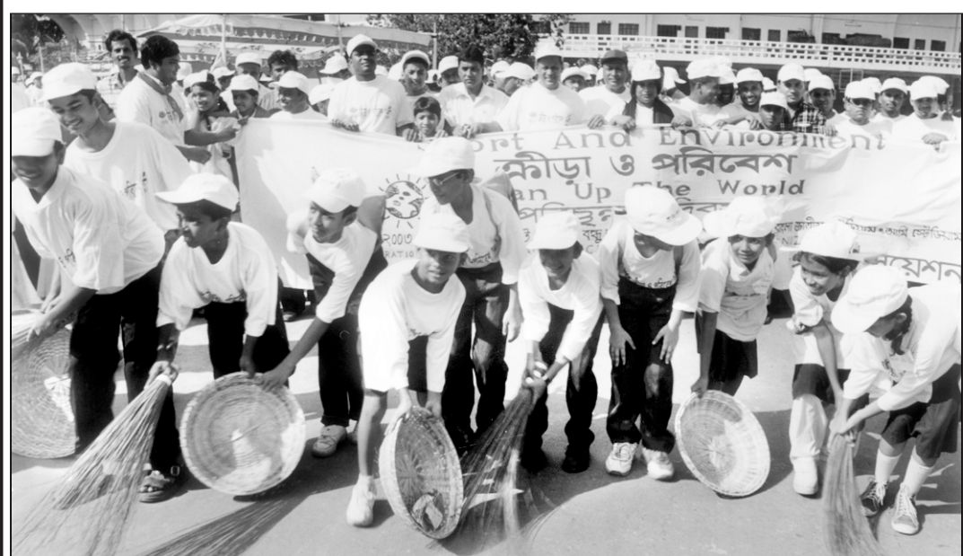
The Bangladesh Olympic Association organised a programme titled 'Sport and Environment' near the Bangabandhu National Stadium yesterday.