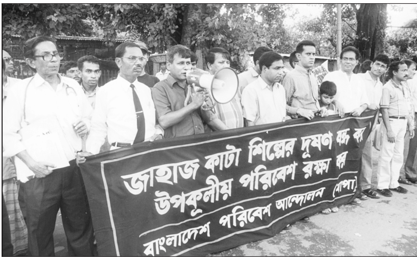
Bangladesh Paribesh Andolon forms a human chain at Shahbagh crossing in the city yesterday demanding government steps to check pollution of coastal environment by ship-breaking industry.