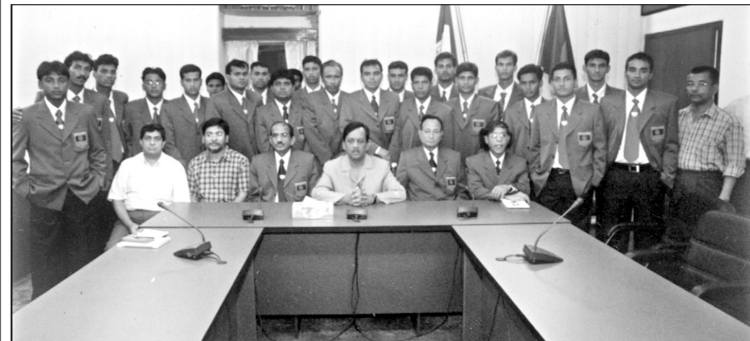
Members of the Asia Cup hockey team pose for photographs with the State Minister for Youth and Sports M Fazlur Rahman at the NSC yesterday.