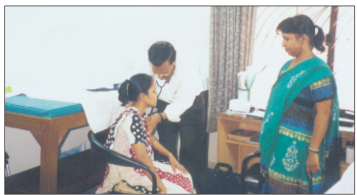
The Rotary Club of Dhaka Central organised a medical camp for the acid victims at the Acid Survivors Foundation yesterday. About 42 acid victims received medical treatment.