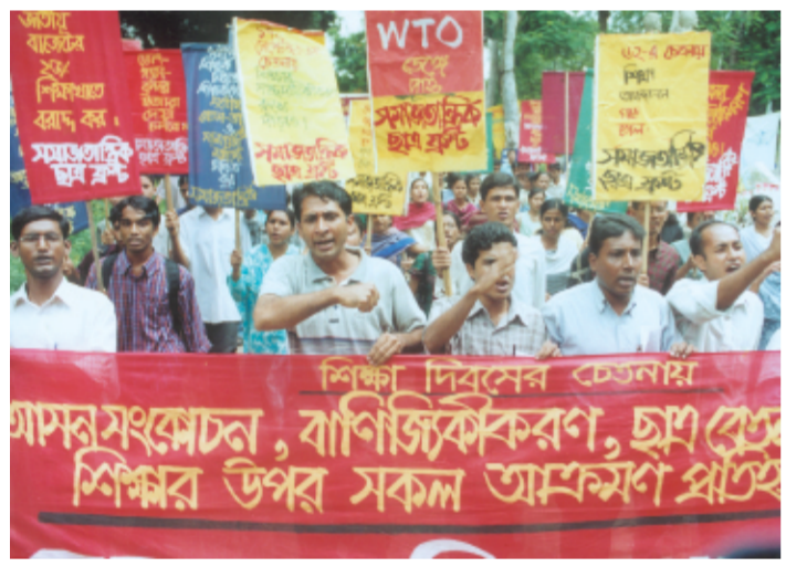
Samajtantrik Chhatra Front took out a procession on the Dhaka University campus yesterday to mark the Education Day.