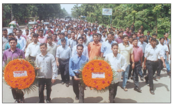
The Jatiyatabadi Chhatra Dal took out a procession on the Dhaka University campus yesterday to mark the Education Day.

Children of expatriate Bangladeshis have been included in a recently introduced special quota system for admission to public and private educational institutes at the higher secondary level.