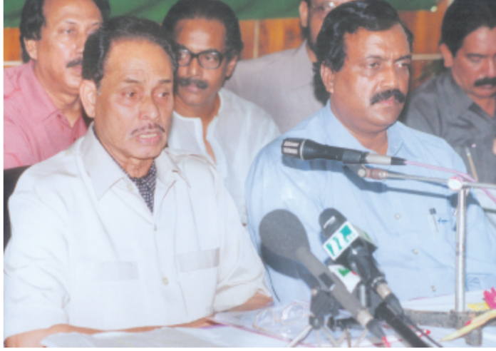
Former President and Jatiya Party Chairman H M Ershad speaks at a 'meet the press programme' in the city yesterday.