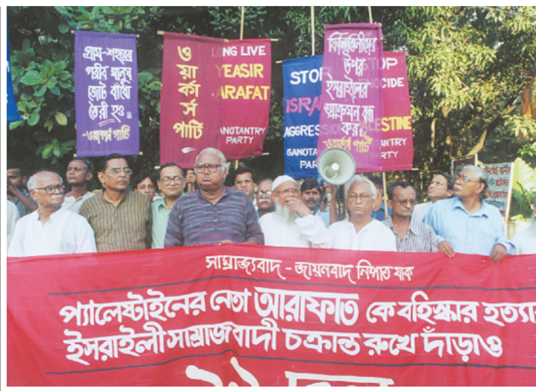
The 11 Party stages a demonstration in the city yesterday to protest Israeli threat to expel and kill Palestinian President Yasser Arafat.