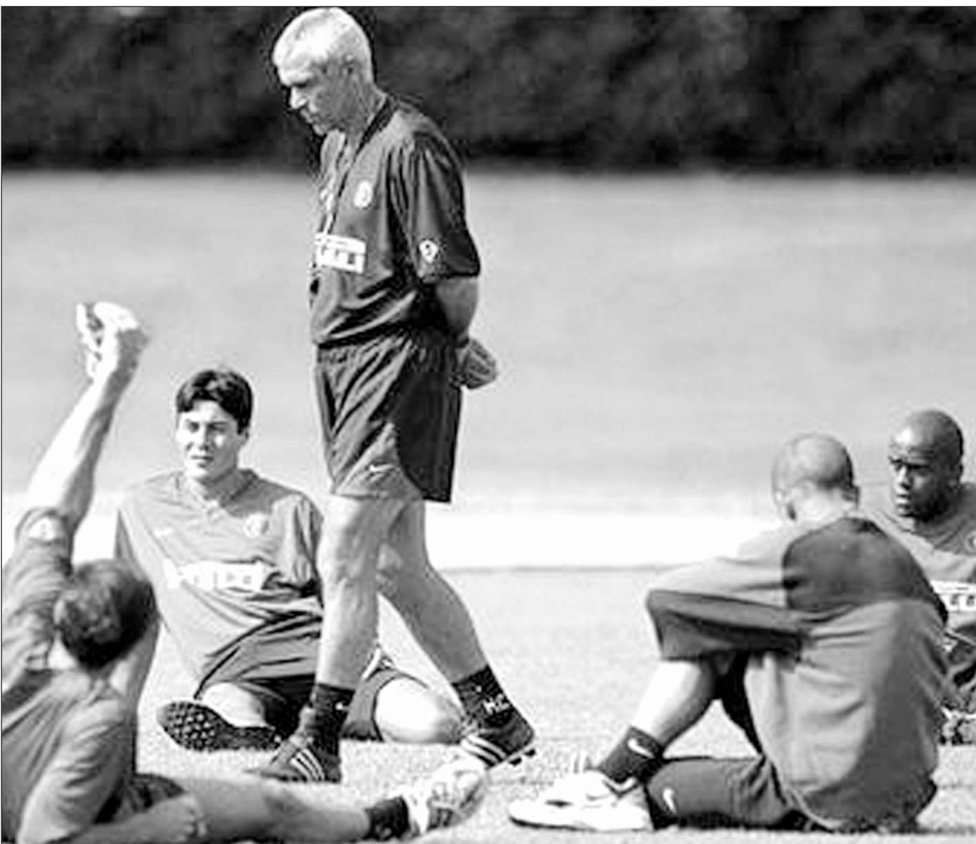
Inter Milan coach Hector Cuper walks past some players who are relaxing during a training session at the club's Appiano Gentile base yesterday.