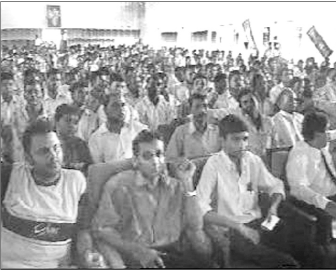
A partial view of the biennial convention of Nilphamari Sadar BNP, held on Sunday.