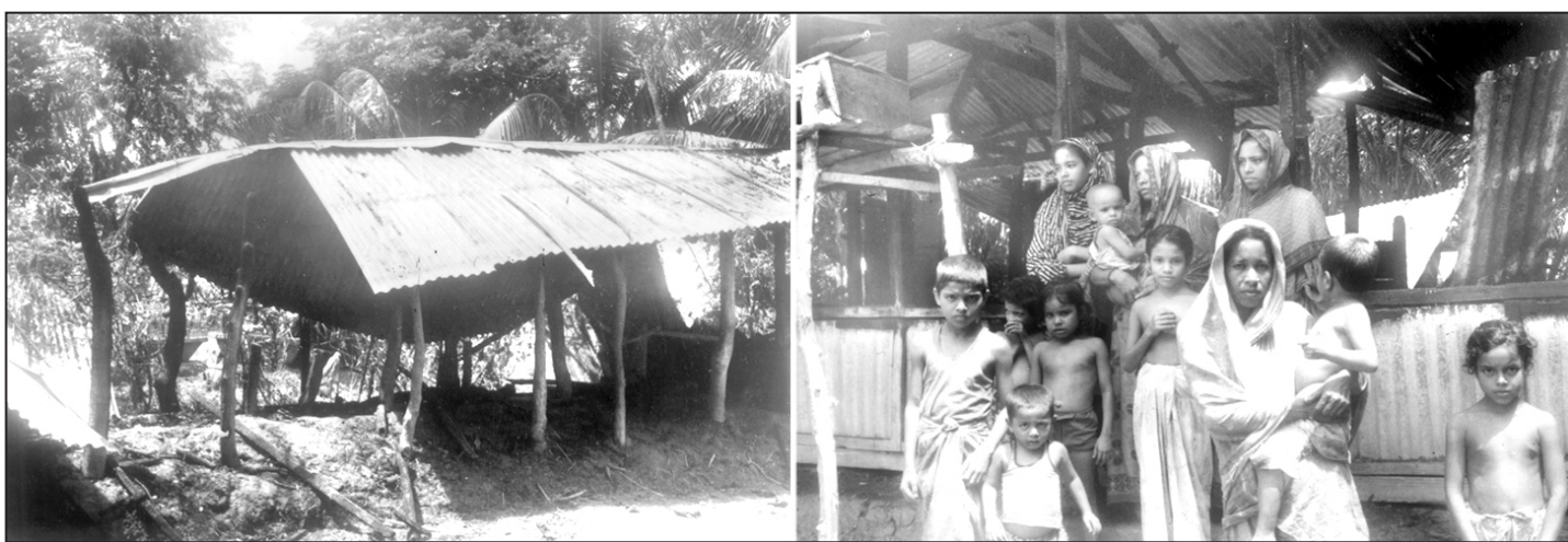
(Left) One of many houses gutted at Char Jabbar in Noakhali by jungle bandits on Friday. (Right) Panic-stricken women and children gather in front of their damaged houses while males have fled homes fearing reprisal by the bandits and alleged police harassment.