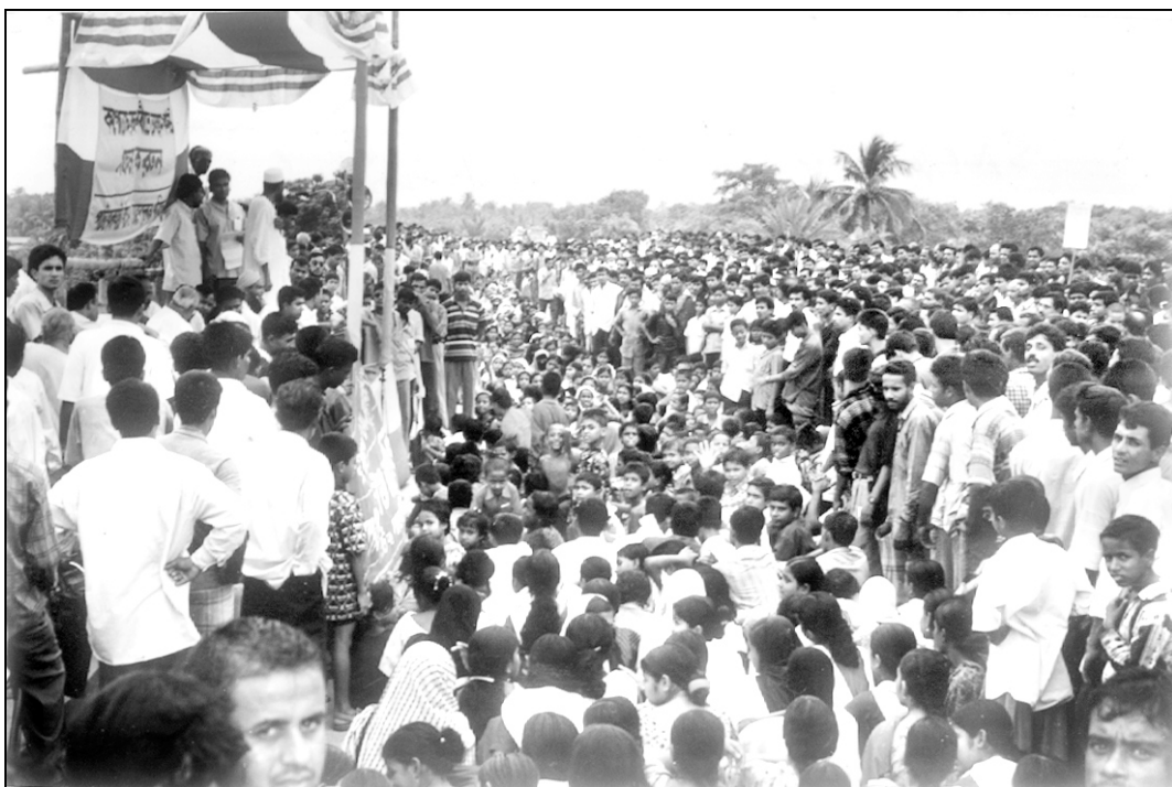
A partial view of the meeting after a sit-in held near Patkelghata bridge at Tala in Satkhira on Friday, demanding re-excavation of the Kobadak river.

OUR CORRESPONDENT, Barisal Workers on Sunday laid siege to Barisal divisional office of the Roads and Highways Department (RHD) for two hours demanding withdrawal of a decision to hand over construction and maintenance work of about 9,000-kilometre roads to the Local Government Engineering Department (LGED) and also realisation of other demands. They locked the office of RHD Additional Chief Engineers. Following the siege they brought out a procession in the city. Other demands included cancellation of a decision to stop a privatisation move of the ferry services in the southern region, regularisation of services of charge workers and cancellation of execution of IDC settings.