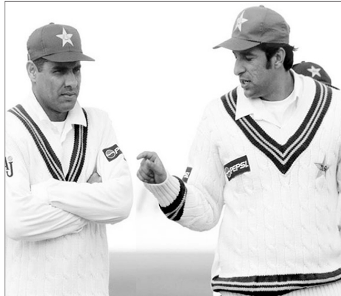
NEVER FRIENDS: Waqar Younis (L) and Wasim Akram