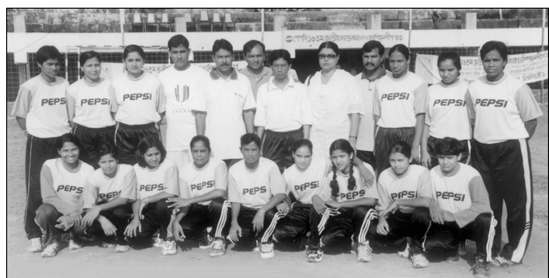
Members of the BJMC team, who became the Pepsi 16th National Women's Handball champions, pose for photographs yesterday.